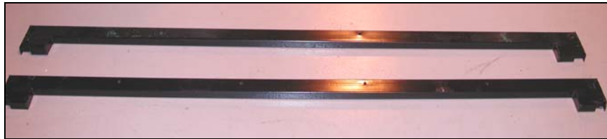
(2) BED SUPPORTS