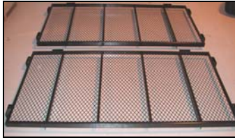
(2) OUTSIDE BEDS