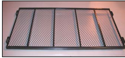
(1) MIDDLE BED